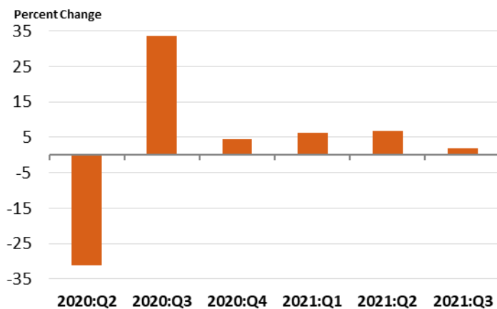
Quarter-to-Quarter Change in Real GDP

U.S. Bureau of Economic Analysis Seasonally adjusted annual rates